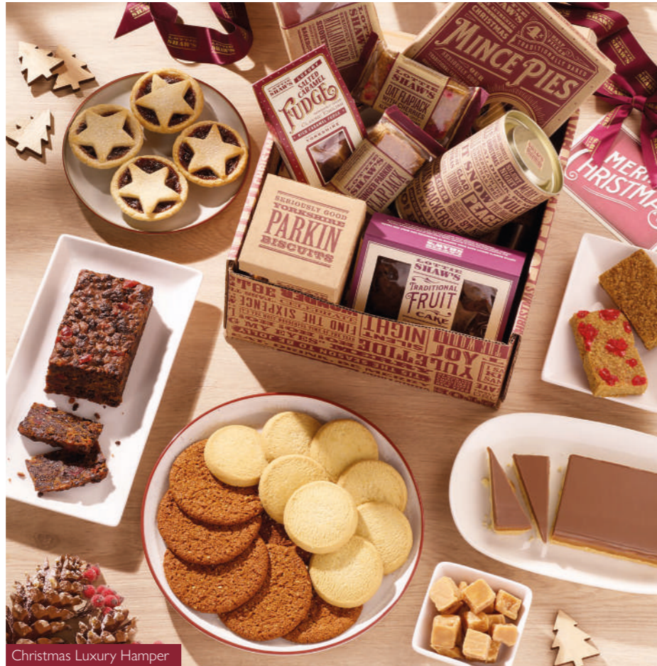
Christmas Luxury Hamper