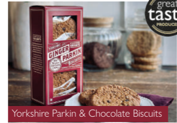
Yorkshire Parkin & Chocolate Biscuits

Yorkshire Parkin Ginger Biscuits smothered in dark Belgian chocolate to make them proper posh. Six generously sized individually wrapped biscuits are nestled inside our large presentation box - a beautiful gift or a decadent teatime treat.