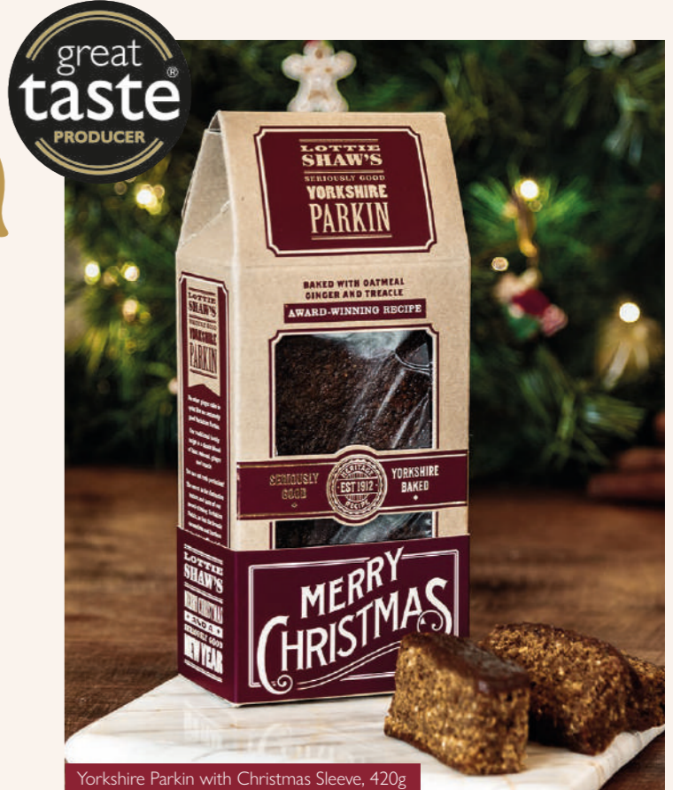
Yorkshire Parkin with Christmas Sleeve, 420g

Our signature, award winning Yorkshire Parkin comes in our classic box with a Merry Christmas sleeve making it the perfect stocking filler or treat to share this festive season.