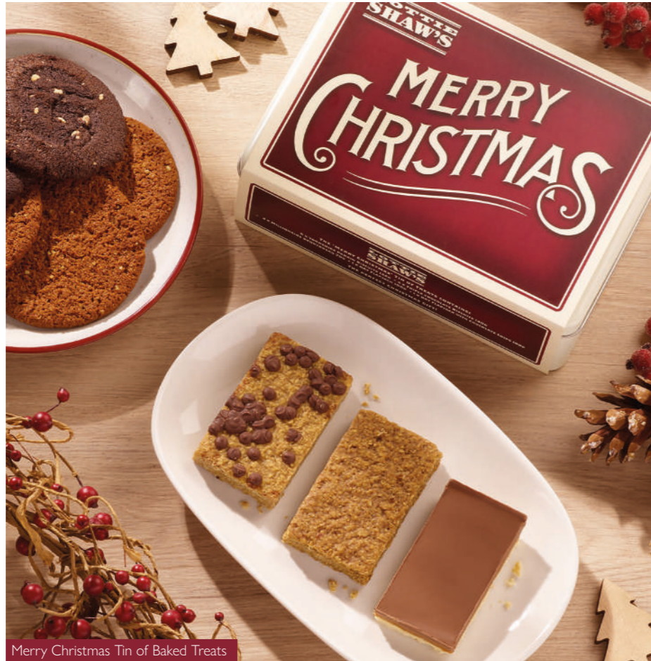
Merry Christmas Tin of Baked Treats

Our classic cream tin is embossed with our logo and finished with a striking seasonal sleeve, perfect to unwrap this Christmas and then refill with more Lottie Shaw's treats.