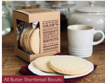
All Butter Shortbread Biscuits

Our traditional All Butter Shortbread Biscuits are firm favourites here at Lottie Shaw's. Baked to our traditional family recipe and sprinkled with sugar.