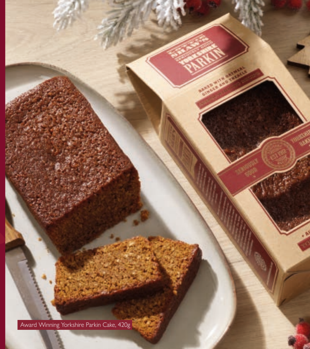
Award Winning Yorkshire Parkin Cake, 420g