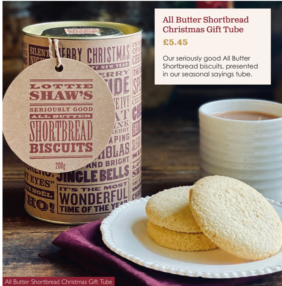
All Butter Shortbread Christmas Gift Tube

A box of eight All Butter Shortbread Biscuits, baked to our traditional Yorkshire recipe. Seriously good with a cup of tea, or to make a perfect dessert, top with strawberries and cream.