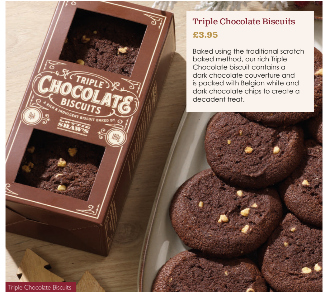
Triple Chocolate Biscuits

A Great Taste Award winning biscuit baked with oatmeal, raisins and a hint of cinnamon.