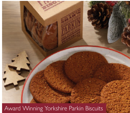
Award Winning Yorkshire Parkin Biscuits

Our seriously good biscuit range has something for everyone. Enjoy cosied up next to the fire with a cup of tea on those cold Winter nights.