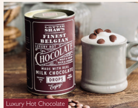
Luxury Hot Chocolate

Our Proper Posh Milk Chocolate buttons are made with the finest Belgian chocolate and chunks of our award winning Yorkshire Parkin Biscuits for a subtle ginger crunch.