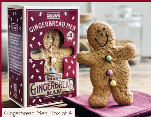
Gingerbread Men, Box of 4

Browse our range of Yorkshire gingerbread, baked to our traditional family recipe and cut into fun seasonal shapes making the perfect stocking fillers for all ages.