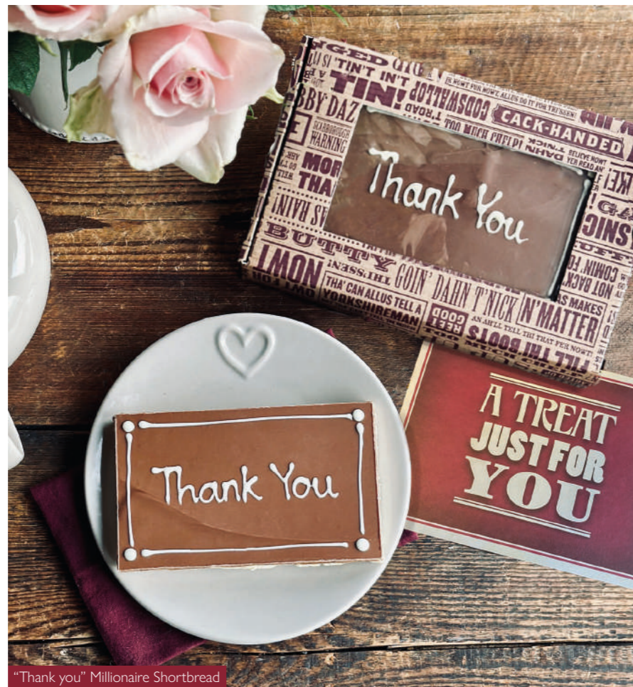
"Thank you" Millionaire Shortbread

Choose from a selection of Hand Piped Millionaire Shortbread, each baked with an all butter shortbread base, smothered in luxury caramel, topped with Belgian chocolate and hand piped with a message. Presented in our traditional Yorkshire sayings box with window.