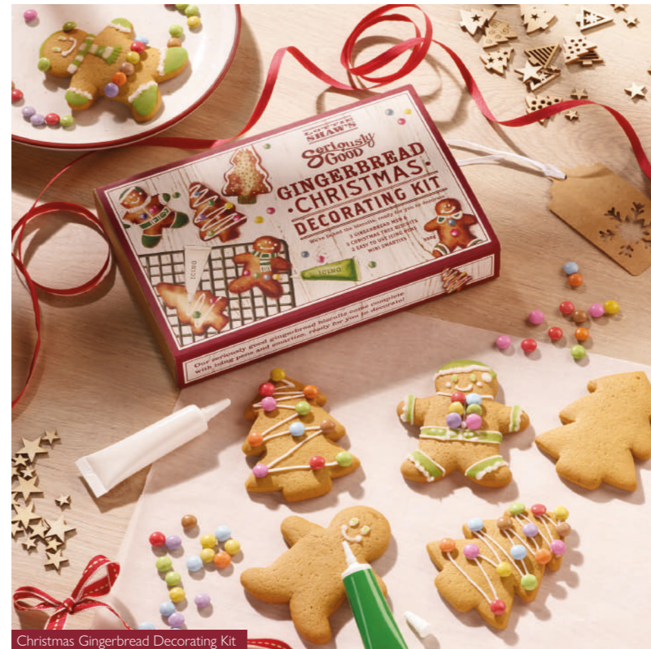
Christmas Gingerbread Decorating Kit

Our traditional family gingerbread recipe, cut into a seasonal snowman shape and hand decorated by our talented team of bakers.