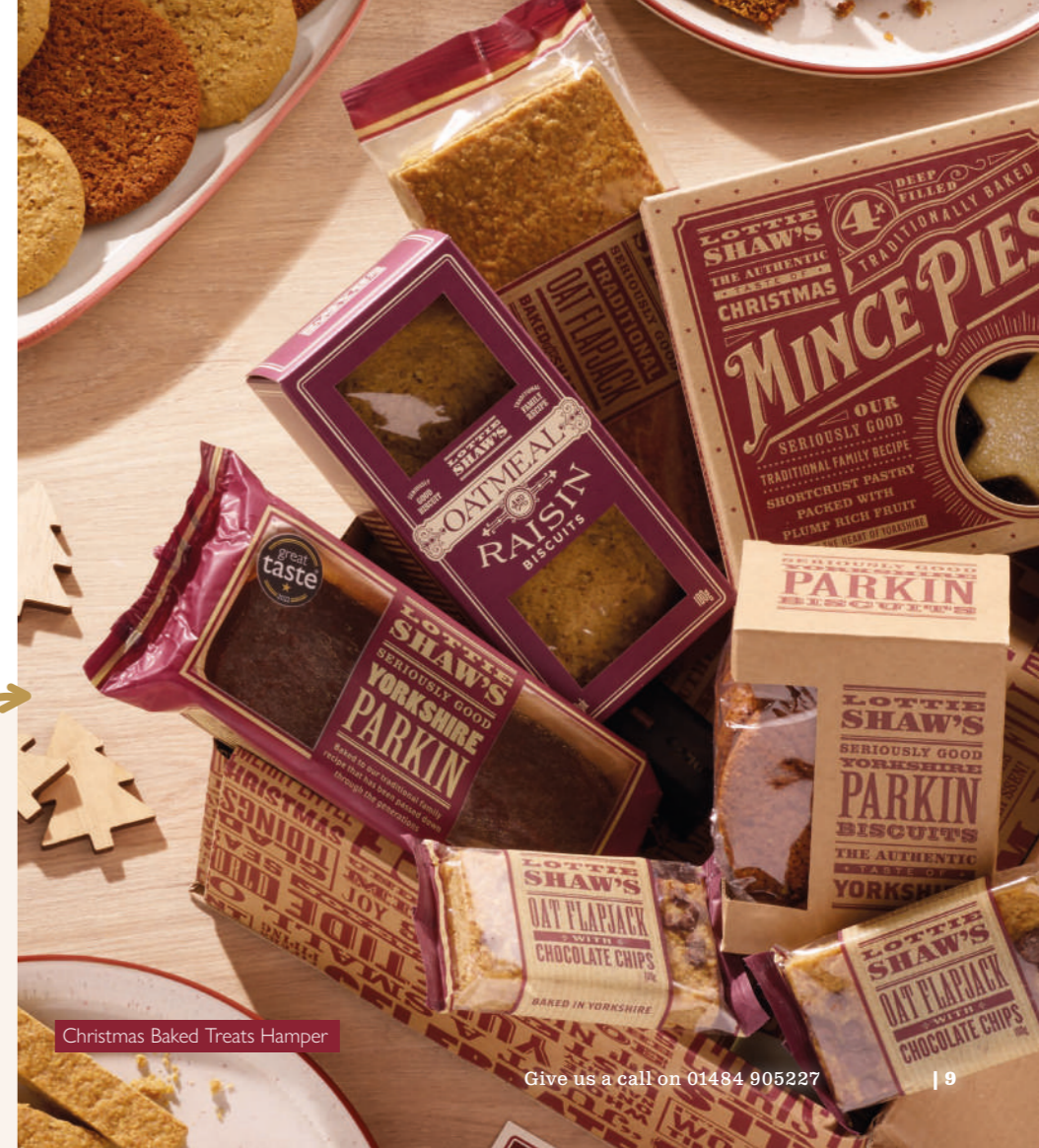
Christmas Baked Treats Hamper

This regional sticky ginger delicacy is made with flour, oatmeal, black treacle and syrup to create the authentic taste of Yorkshire.