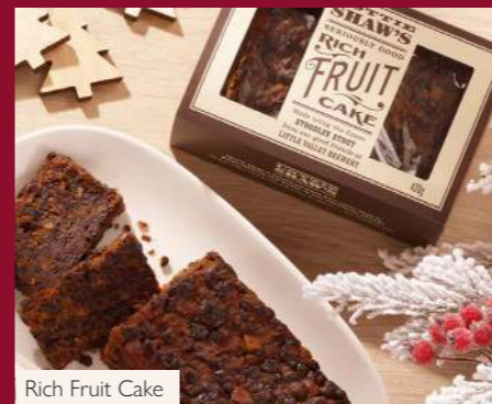
Rich Fruit Cake

What could be more traditional than a Fruit Cake. Each cake is hand wrapped and presented in a card box making it the perfect treat to be enjoyed with a cup of tea and a slice of cheese, just as we do in Yorkshire.