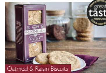
Oatmeal & Raisin Biscuits

Baked using our award winning Yorkshire Parkin Biscuit recipe with added chocolate chunks.