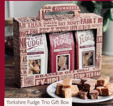
Yorkshire Fudge Trio Gift Box

Our trio boxes of treats are great stocking fillers. Containing three signature Lottie Shaw's flavours of traditional treats.